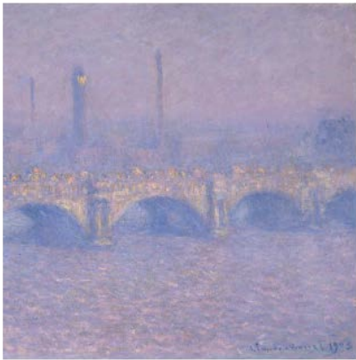
Claude Monet, "Waterloo Bridge, Veiled Sun" (detail) 1903