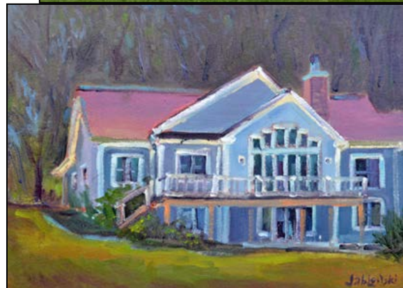
Barbara's Architectural Workshop Demo Painting